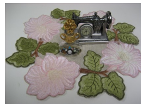
Jenny Haskins Rose Doily.

In this class students will learn layered embroidered applique as they create this beautiful doily in the hoop. Kit is included. $45 10am-2pm